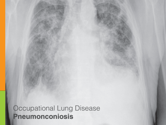
Occupational Lung Disease Pneumonconiosis

Do You Know: Occupational diseases are on a rise, with the commonest disease being Occupational Noise Induced Hearing Loss (NIHL), Occupational Lung Diseases (OLD), and Occupational Muscular - Skeletal Disorders (OMD).